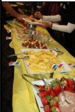
World Food Sampler by C&L Catering