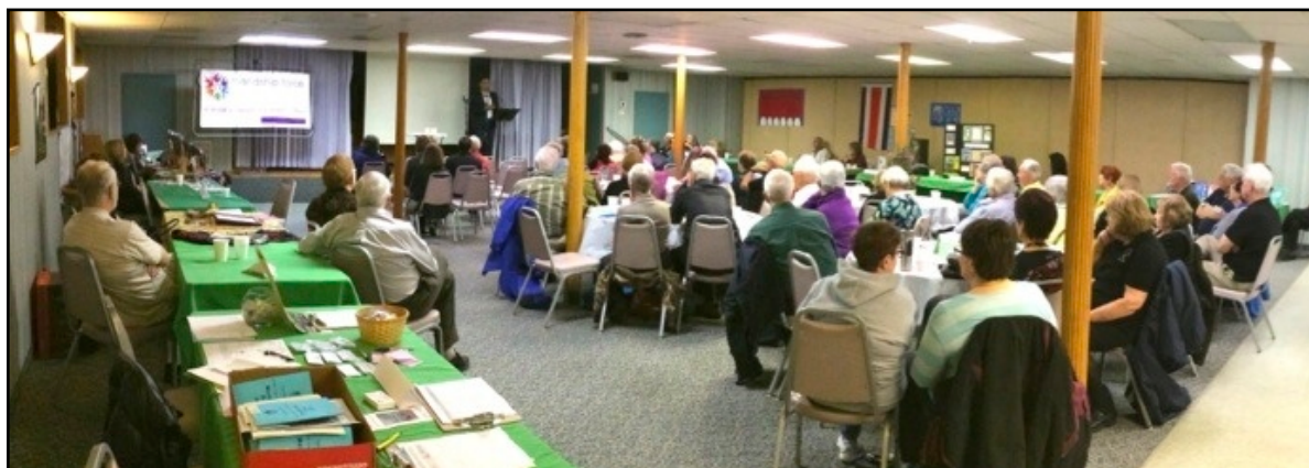
The TaborSpace dining room was a perfect location for our event