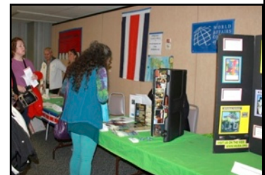
Information tables set up by community groups